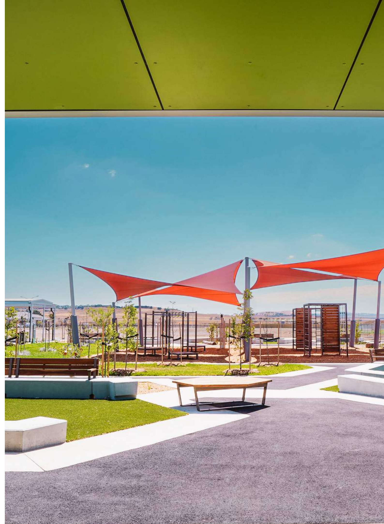
MERRIFIELD SECONDARY COLLEGE